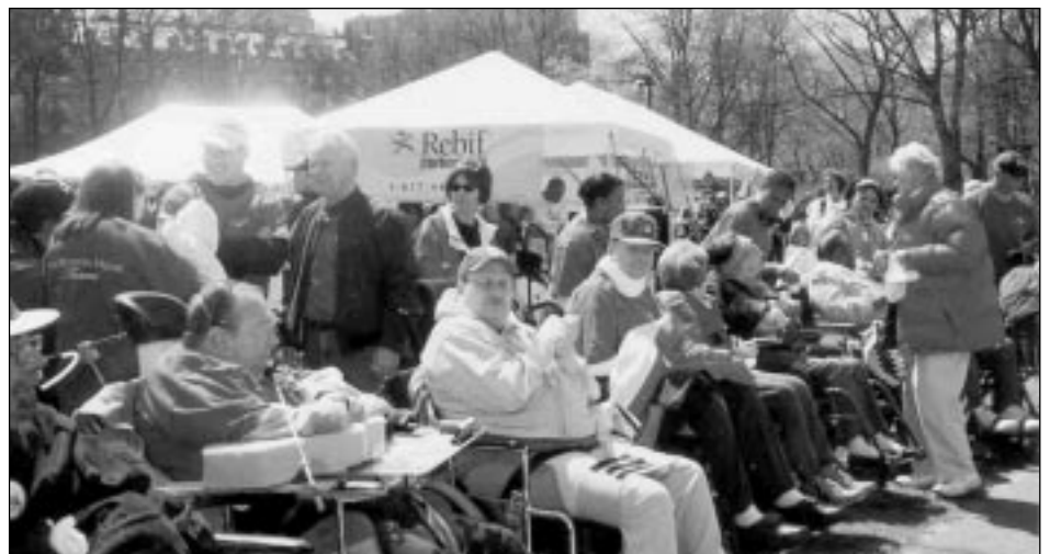
The Boston Home team relaxes after the annual MS Walk. — See photo spread on page 4.